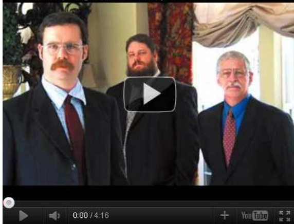
Necrotic Apologues-The County Medical Ex

But, the question remains: Who are the top ten gimmick bands? Read on.