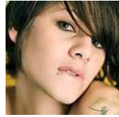
Most Controversial Music Videos Ever