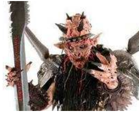
Oderous Urungus of GWAR

When it comes to our musical preferences, we pretend that we value artistic integrity, strong musicianship, and meaningful lyrics above all else. But in truth we often fall for a good gimmick. Whether it's a made-up backstory, bizarre characters for each band member, or strange inspirations for lyrics, it's easy to dig a good gimmick band.